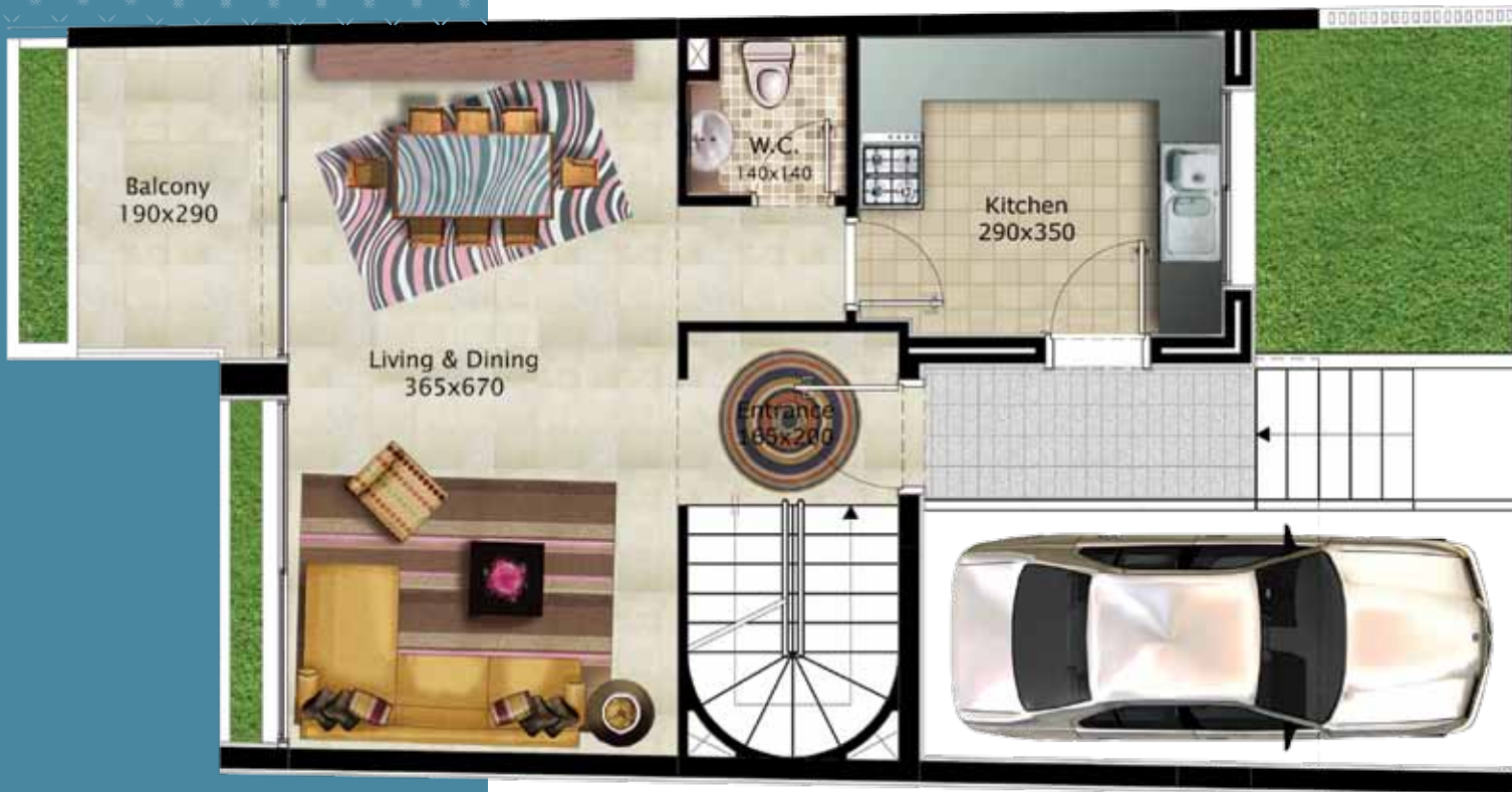
Ground Floor with main entrance, kitchen, guest bathroom living room, dining room and a balcony.