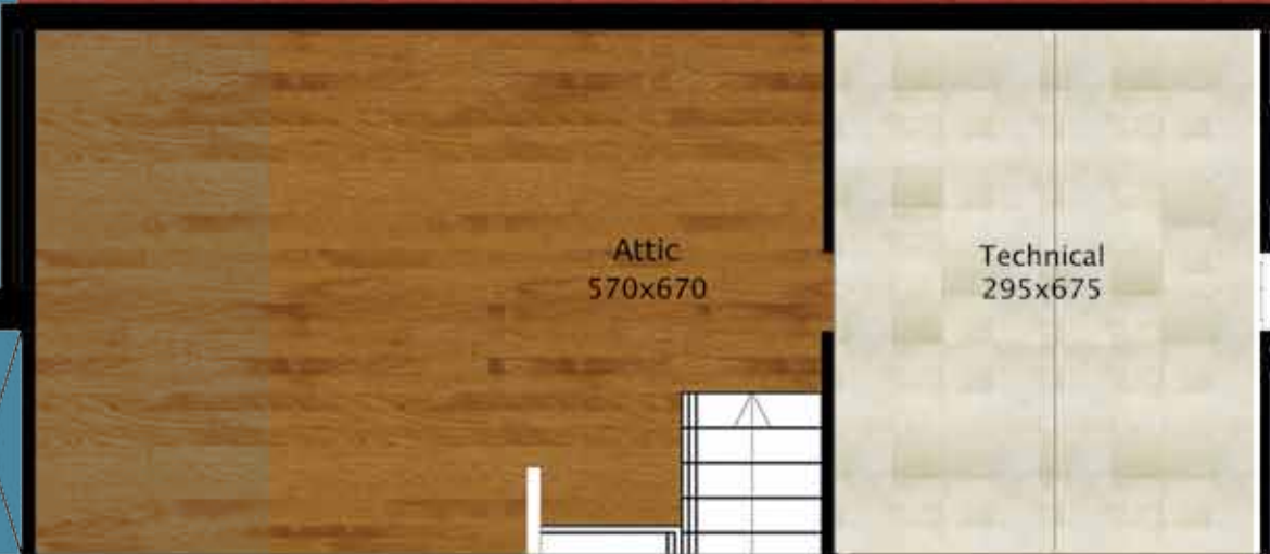
Attic floor with a large multipurpose room and a technical room.